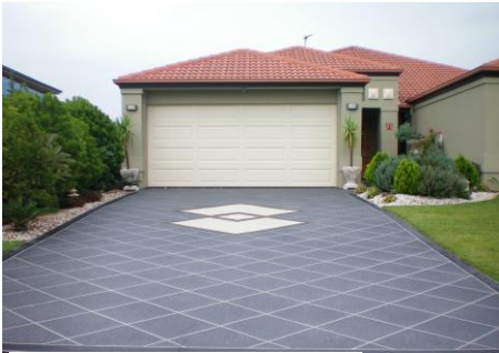
Decorative concrete coating

A decorative concrete coating is an ideal application if the current concrete is still in good condition but a different look is desired. This option is usually cheaper than tiles and come in numerous different styles and colours which suit most areas. The surface is slip resistant and highly durable to the Australian weather as well as wear and tear from foot and vehicle traffic which makes it a suitable surface for patios, paths and driveways.