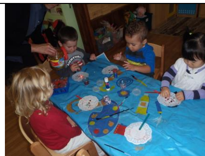
Making flowers for our mums.