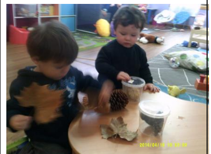
Sensory touch with natural resources.