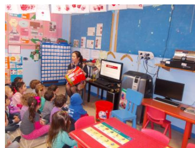
Making our rain water bucket.