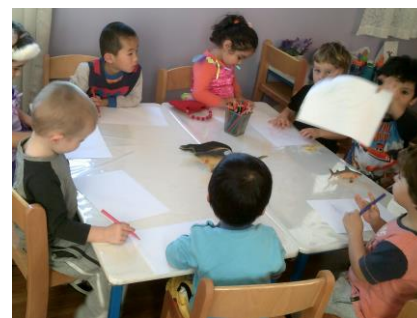
Drawing the sea animals.