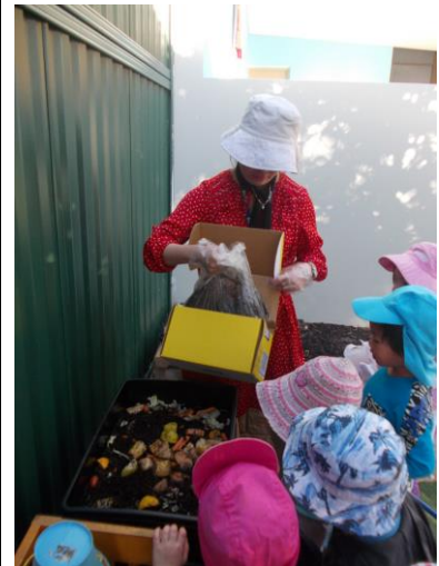
Adding more worms in our worm farm.