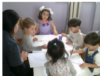
The Lionfish drew about their feelings.