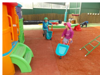
Another beautiful day for outdoor play.