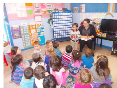
My Lego Project.