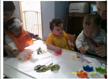
The Clownfish goes natural with their art and craft.

If possible; could you send in a photo of your baby with