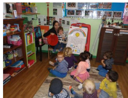
Rain water bucket.