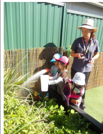
Watering our garden together.