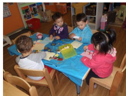
Making star collages.