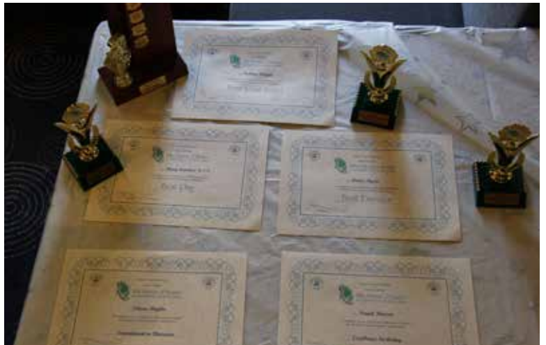
Well done the Irish