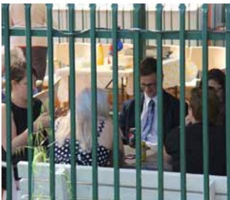
Where they should be