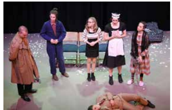
Mystery at Dunbar Mansion