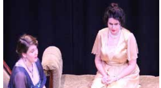
He Said and She Said