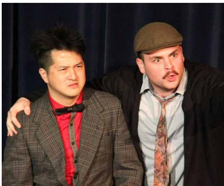
Just a Straight Man