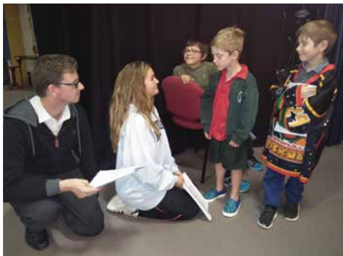
Seen rehearsing for Jungle Book