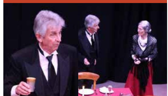
Dinner for One