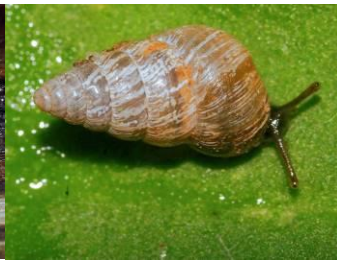
Prietocella barbara Small Pointed Snail