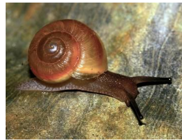
Sinumelon gawleri Greater Gawler Ranges Dwarfmelon