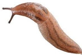
Lehmannia nyctelia Striped Field Slug