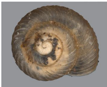
Paralaoma insularis Spencer Gulf Pinhead Snail