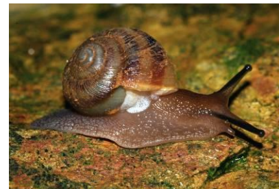
Sinumelon bitaeniatum Twin-banded Dwarfmelon