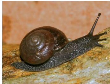
Cupedora patruelis Burgundy Shrubland Snail