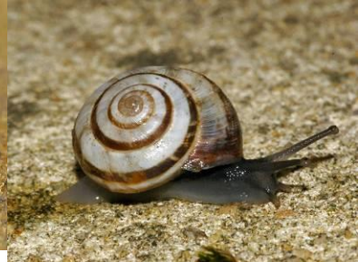
Cernuella virgata Vineyard Snail