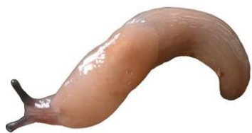
Deroceras laeve Marsh Slug

Image credits: Tony Robinson (live) and Des Beechey (stills).