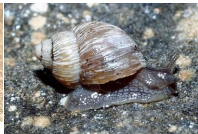
Bothriembryon barretti Barrett's Tapered Snail