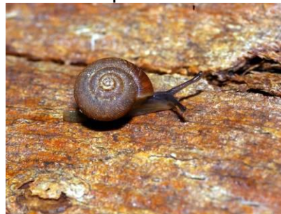
Excellaoma retipora Woodland Pinwheel Snail