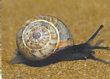
Theba pisana European White Snail