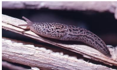
Limax maximus Leopard Slug