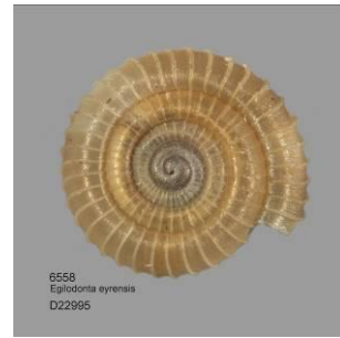
Egilodonta eyrensis Eyre Peninsula Pinwheel Snail