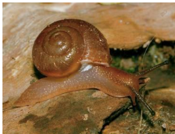
Sinumelon flindersi Port Augusta Dwarfmelon