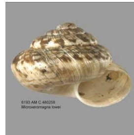
Microxeromagna lowei Citrus Snail