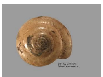
Echonitor euroxestus Eyre Peninsula Glass- snail