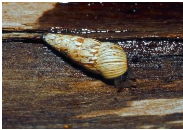
Cochlicella acuta Pointed Snail