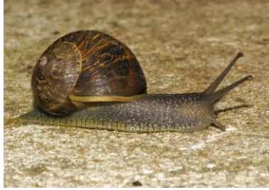
Cornu aspersum European Garden Snail