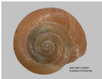
Cupedora lincolnensis Port Lincoln Shrubland Snail