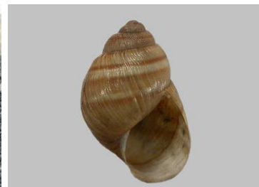
Bothriembryon angasianus Eyre Peninsula Tapered Snail