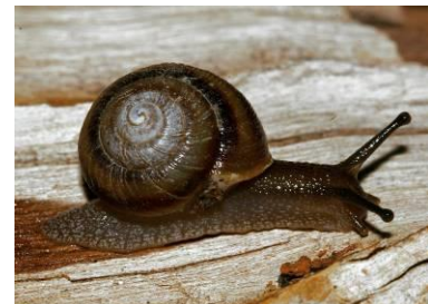
Sinumelon petum Lesser Gawler Ranges Dwarfmelon