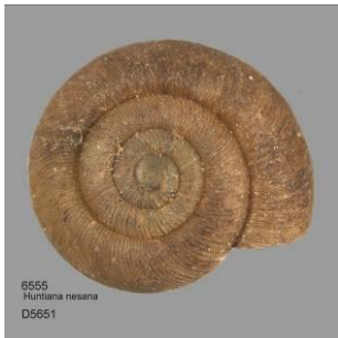
Huntiana nesana Port Lincoln Pinwheel Snail