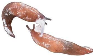
Deroceras invadens Invasive Field Slug