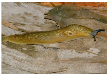
Limacus flavus Yellow Cellar Slug