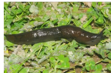
Milax gagates Jet Slug