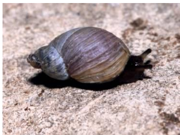
Austrosuccinea australis Southern Amber Snail