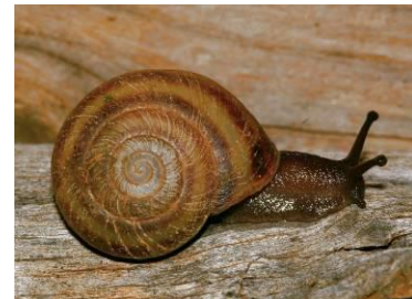
Cupedora rufofasciata Red-banded Shrubland Snail