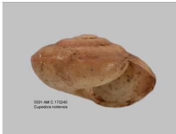
Cupedora nottensis Mount Nott Shrubland snail