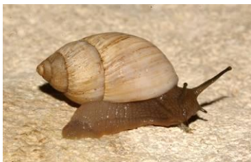
Bothriembryon mastersi Master's Tapered Snail