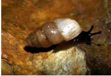
Pupoides adelaidae Adelaide Pupasnail