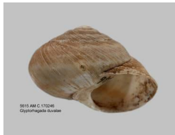
Glyptorhagada duvalae Duval's Wrinkled Snail