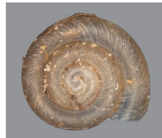
Paralaoma stabilis Evenly-ribbed Pinhead Snail