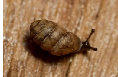
Omegapilla australis Bronze Pupasnail