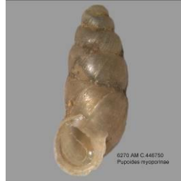
Pupoides myoporinae Southern Sinistral Pupasnail